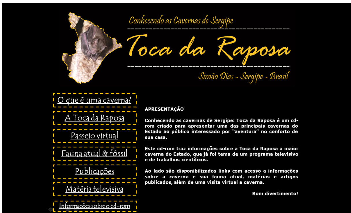
Figure 1: Main navigation screen on the CD-ROM.

The CD-ROM has features that attract the attention of those who handle it: keeps the student participating in the progress of the animations; it is an interactive material, which students will use according to their own learning time; and has images, sounds and videos that can interact with the concepts presented. Thus, learning can be built according to the time and personal curiosity of each student, preserving their individual characteristics.