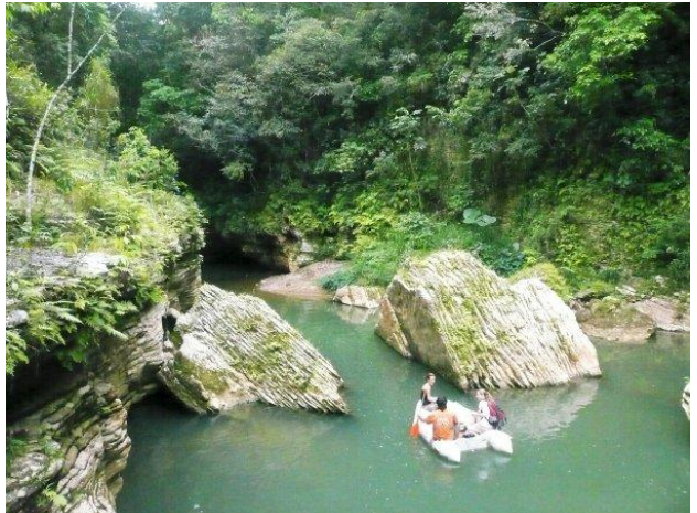
Figure 3: Tourists using river as form of transportation/entertainment in the karst.