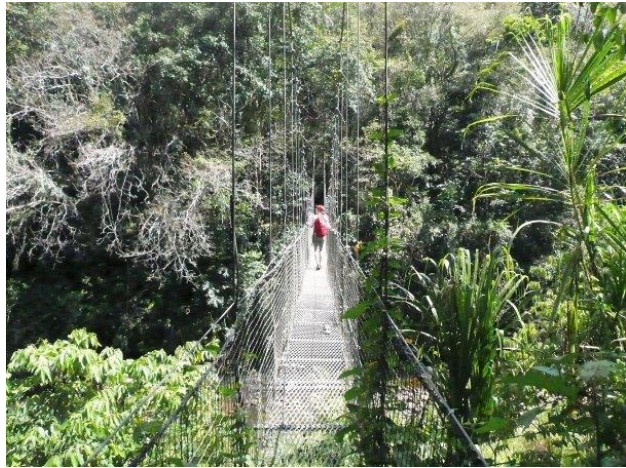
Figure 6: Hammock bridge over Río Tanamá.

Climbing and rappelling are more specialized ecotourism activities within the karst, and often take place adjacent to the rivers where valley-side cliffs provide suitable and accessible locations.