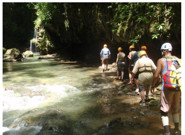
Figure 7: Canyoneering, Río Tanamá.

Canyoneering, in which participants navigate along the narrower river valleys through combinations of hiking, free-climbing, swimming and body rafting, center on the rivers by necessity (Figure 7). Ziplining, descending using gravity by means of a pulley running down a fixed, inclined cable line, is not restricted to river valleys but is often located there because of the local relief available between the valley edges and the river bed, which provides for significant elevations, swift transgress and impressive views (Figure 8).