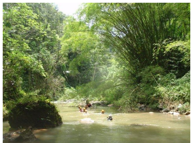
Figure 4: Body-rafting down the Río Tanamá.

Third, water plays a significant educational role within the karst, particularly since water is the fundamental agent in karst landscape development and cave formation. Surface rivers, unroofed caves, cave streams (Figure 5) and springs all provide opportunities for educational activities within ecotourism, focusing on hydrology, geomorphology and biogeography. Through the medium of water, ecotourists learn about karst and cave development, aquatic biology and other aspects of karst science. Water also represents an important tool for communicating information about potential degradation of the karst, focusing, for example, on the potential for water contamination and rapid transfer of pollutants. Additionally, the surface water is an important 'magnet' for wildlife, and thus serves as a major focus for wildlife viewing and tracking, particularly bird-watching, which is one of the primary ecotourism activities (Raffaele 1989).