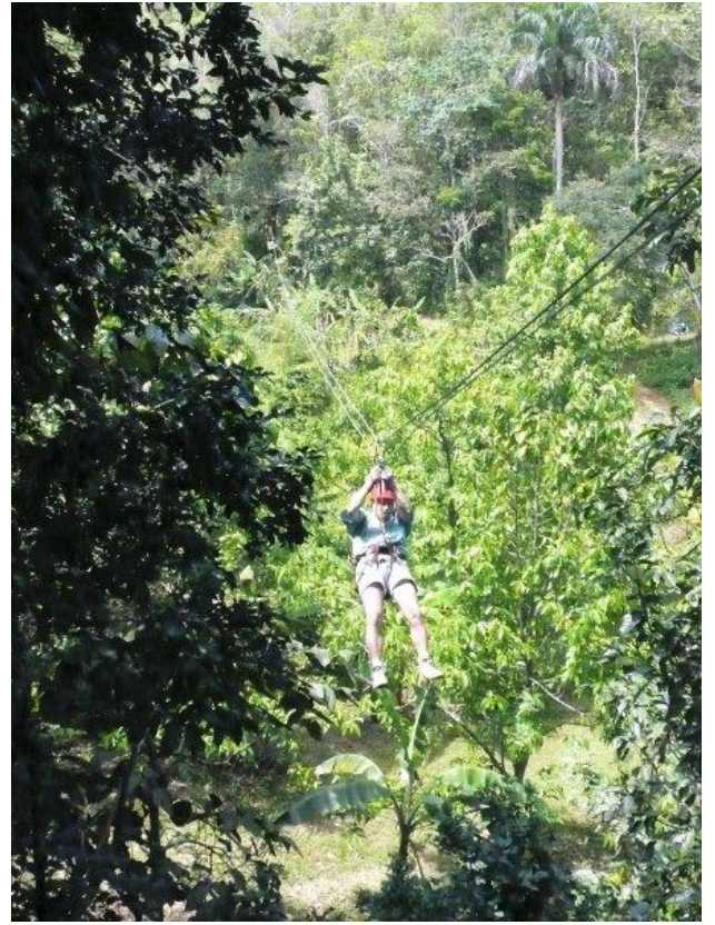
Figure 8: Zip-lining over the Río Tanamá.

Caving is, of course, an ecotourism activity that is inextricably linked to karst, and particularly to the role of water in karst. While caving does not necessarily involve intimate interaction with water, most caving tours do involve water, either in the caves themselves or at the surface before or afterwards.