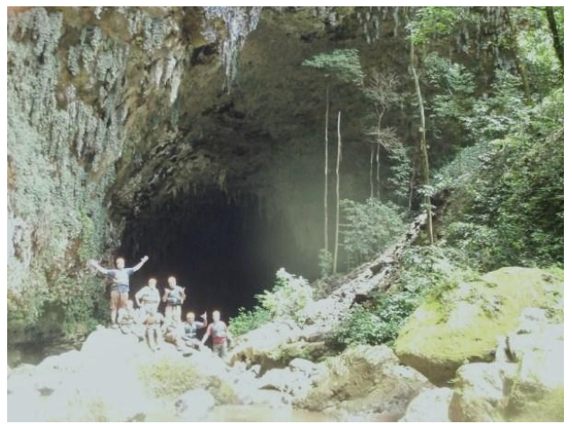
Figure 5: Entrance of river cave on Río Tanamá.

Hiking is a basic component of much of the karst-based ecotourism, either as the primary activity or as a means to other ends, such as climbing, caving or bird-watching. Many hiking trails enter the karst via valleys, and most organized hikes begin and/or terminate at the rivers, particularly providing post-hiking swimming opportunities. In some locations, trails cross the rivers via fords or bridges, adding a different or additional dimension to hikes (Figure 6).