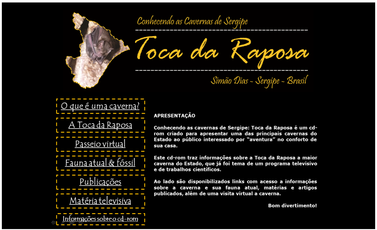
Figure 1: Main navigation screen on the CD-ROM.

The CD-ROM has features that attract the attention of those who handle it: keeps the student participating in the progress of the animations; it is an interactive material, which students will use according to their own learning time; and has images, sounds and videos that can interact with the concepts presented. Thus, learning can be built according to the time and personal curiosity of each student, preserving their individual characteristics.