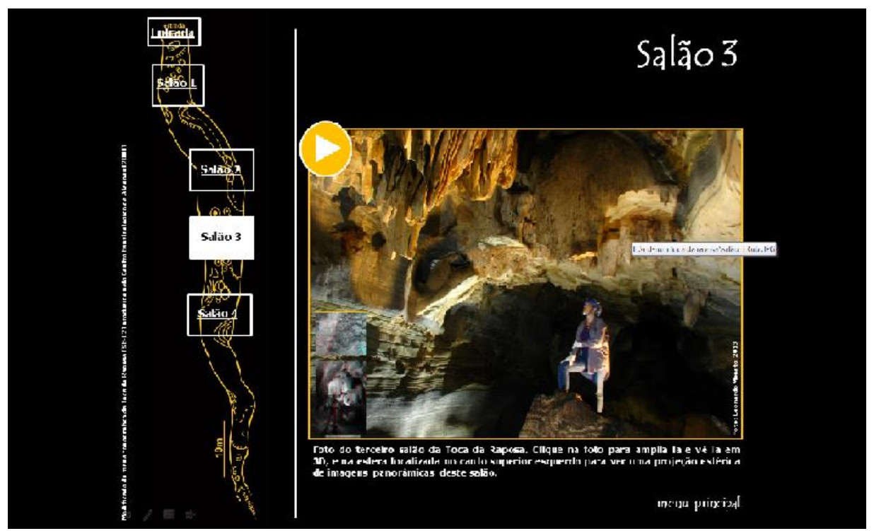
Figure 3: CD-ROM screen showing the map of the Toca da Raposa cave and links that redirect the user to 3D e QTVR images.